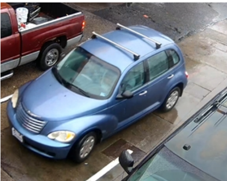
Suspect #1 Vehicle