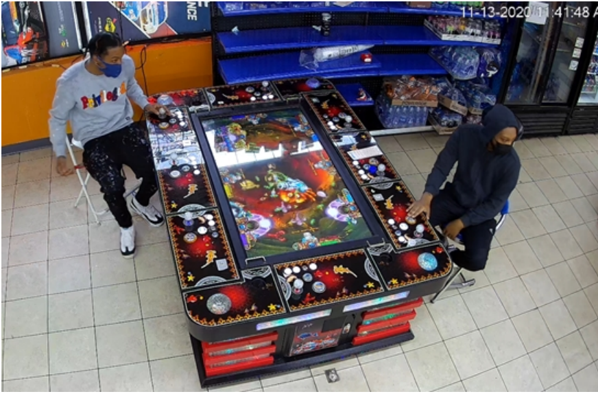
Suspect #1 & Suspect #2