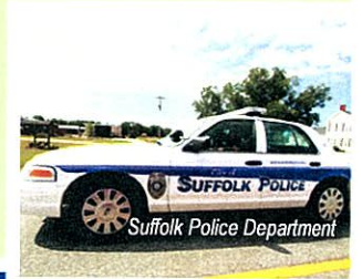
Suffolk Police Department