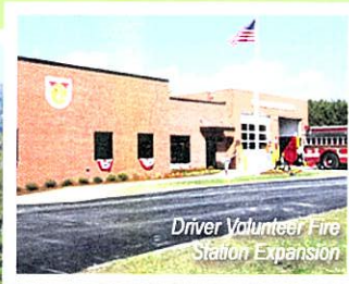
Driver Volunteer Fire Station Expansion