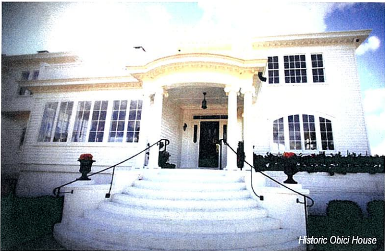
Historic Obici House