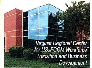
Virginia Regional Center for USJFCOM Workforce Transition and Business Development