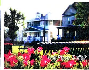
Hall Place Suffolk