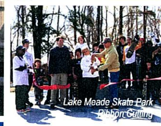
Lake Meade Skate Park Ribbon Cutting