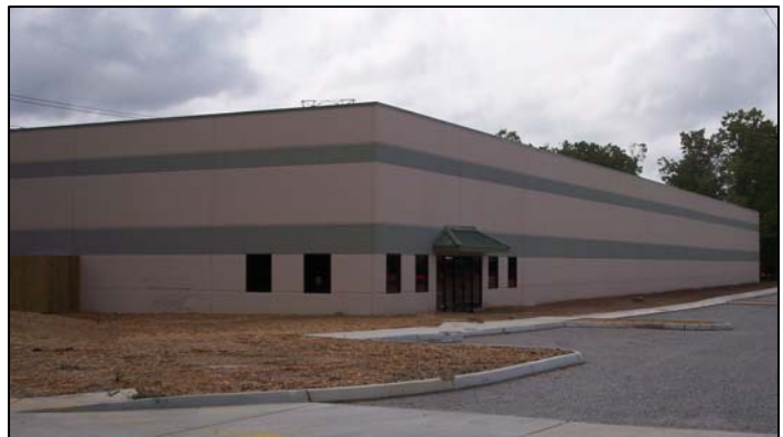
Photo of Suffolk Commerce Center