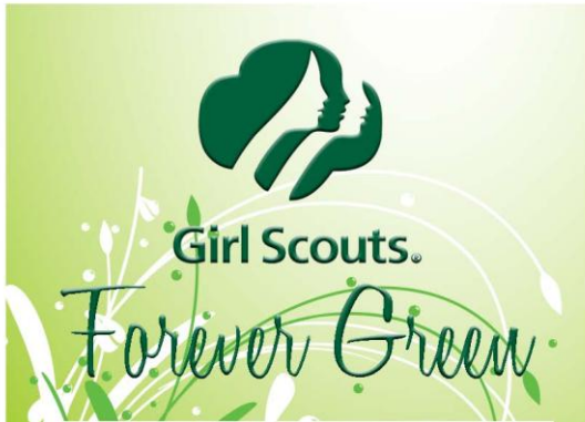
exhibit honoring the 100th Anniversary of Girl Scouting. This exhibit will feature artifacts, photographs and other ephemera. "Forever Green" will be on display January 7-28, 2012, with a closing reception on January 28th, to coincide with the Annual Craft Expo.

The "Winterim" exhibit at the Suffolk Art Gallery will be "Forever Green," an