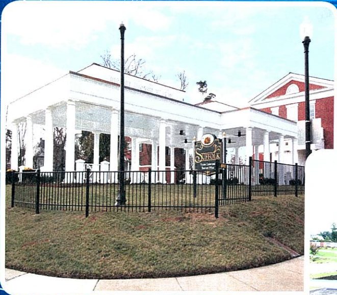
PAVILION AT SUFFOLK VISITOR CENTER