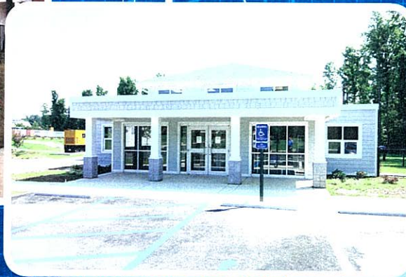
ANIMAL CARE FACILITY