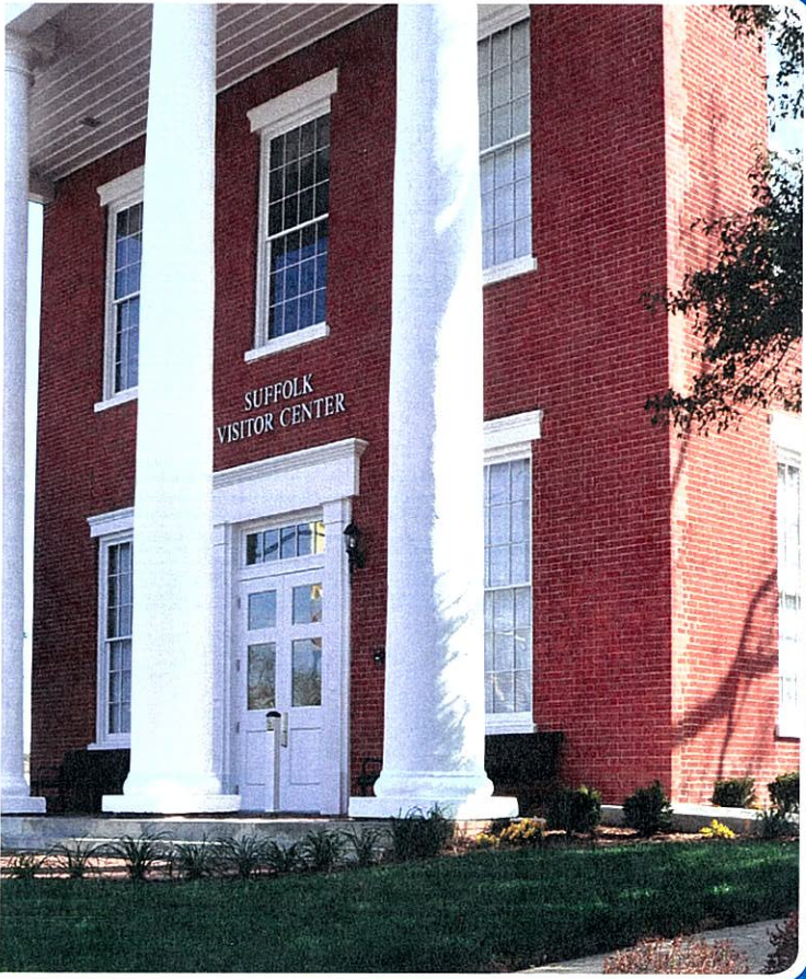
SUFFOLK VISITOR CENTER